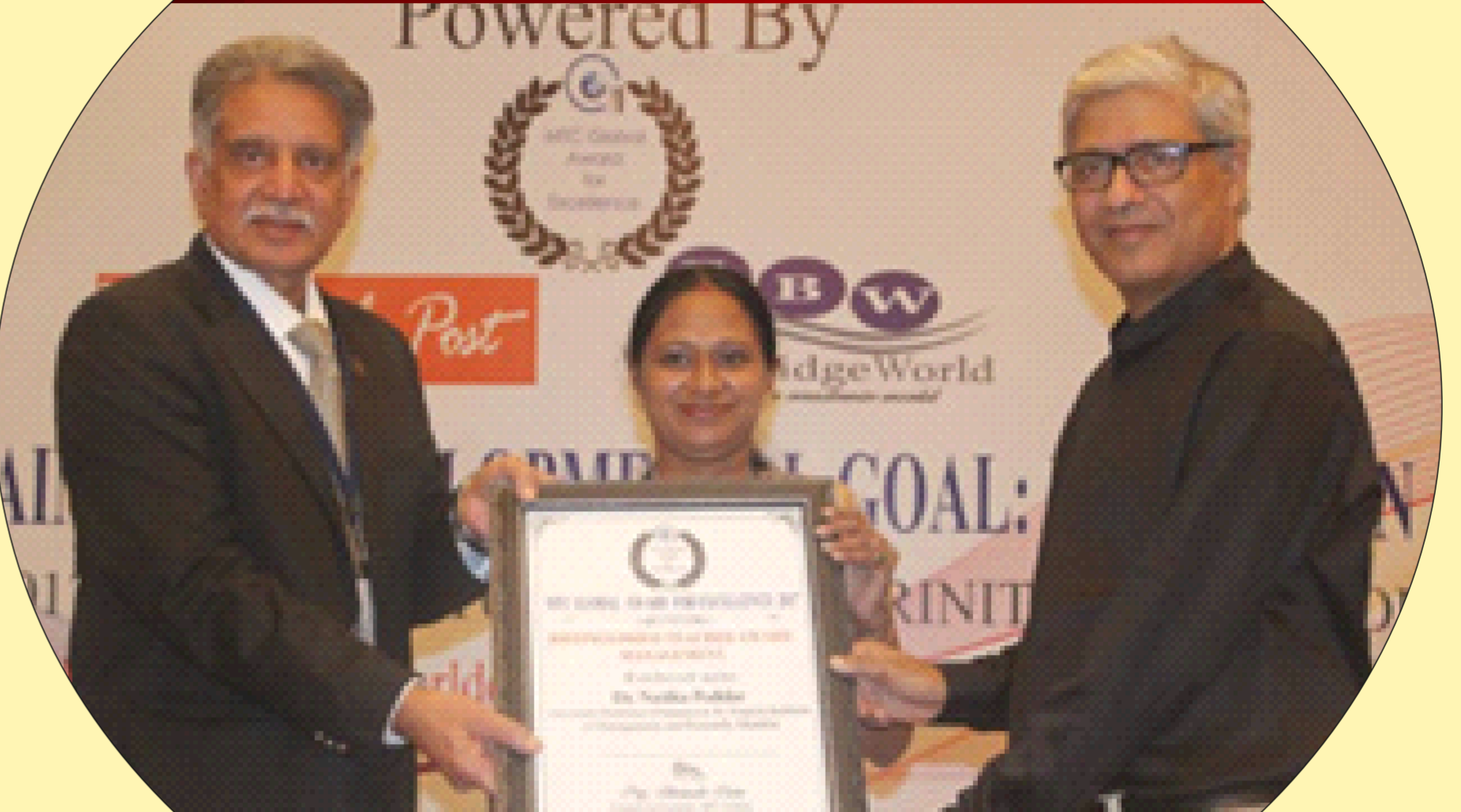
Distinguished Teacher Award 2017 – Management- MTC Global