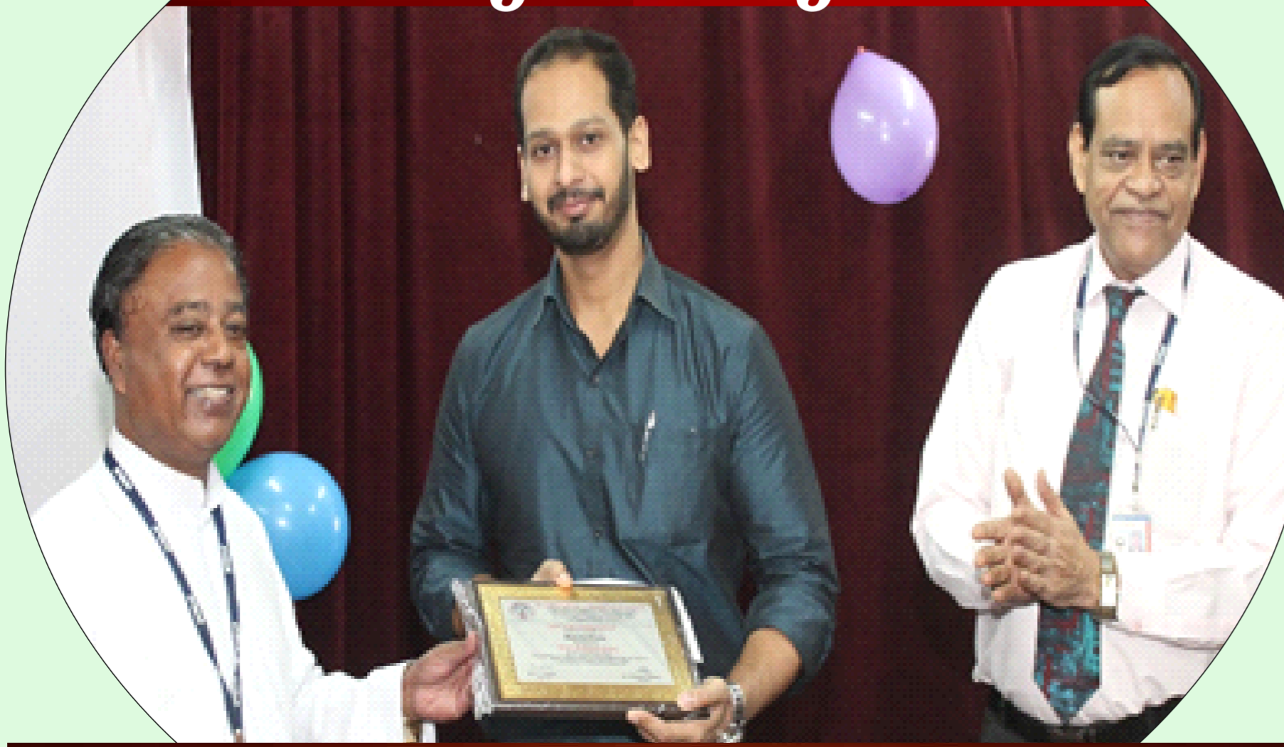
Best Research Paper Award 2nd Prize- 2017, SFIMAR