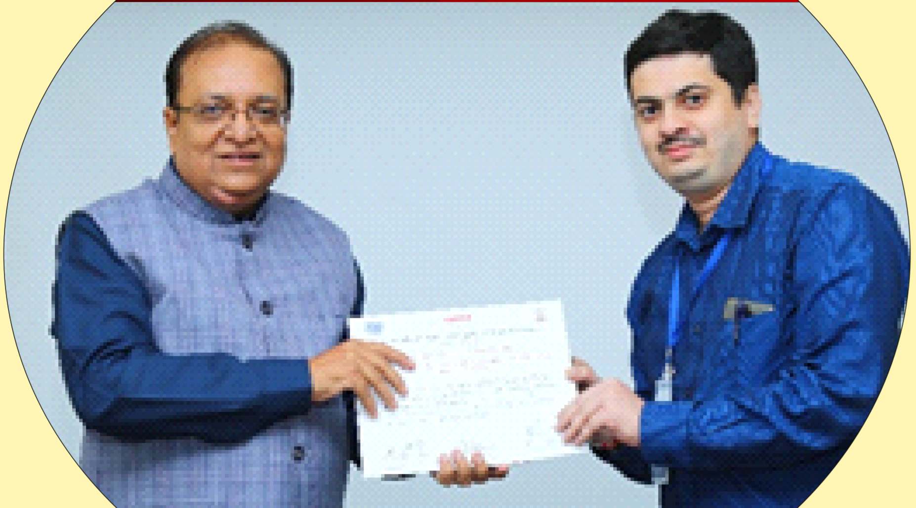
Best Paper Award-"Analysis of Risk and Returns of Public sector banks - (Study to Find out Risk and Returns Generated by Public Sector Banks From 2003 To 2018)" was presented at SIFICO 2019"