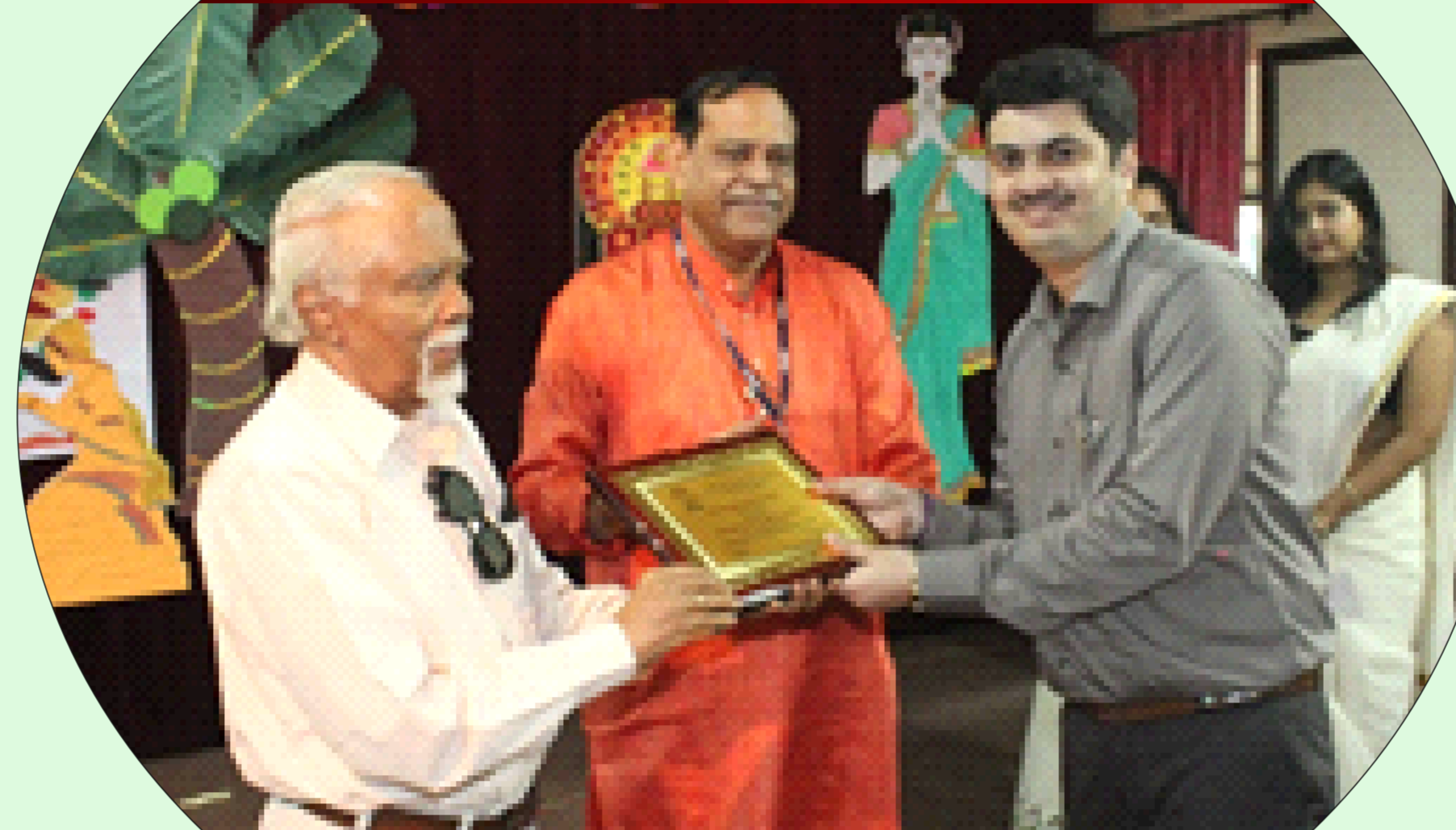
Best Faculty Research Award – SFIMAR, 1st prize 2016