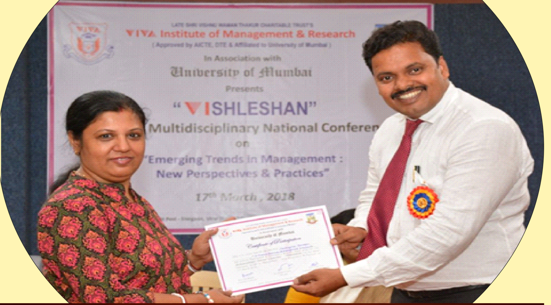
Best Research Paper Award Vishleshan 2018- VIVA Institute