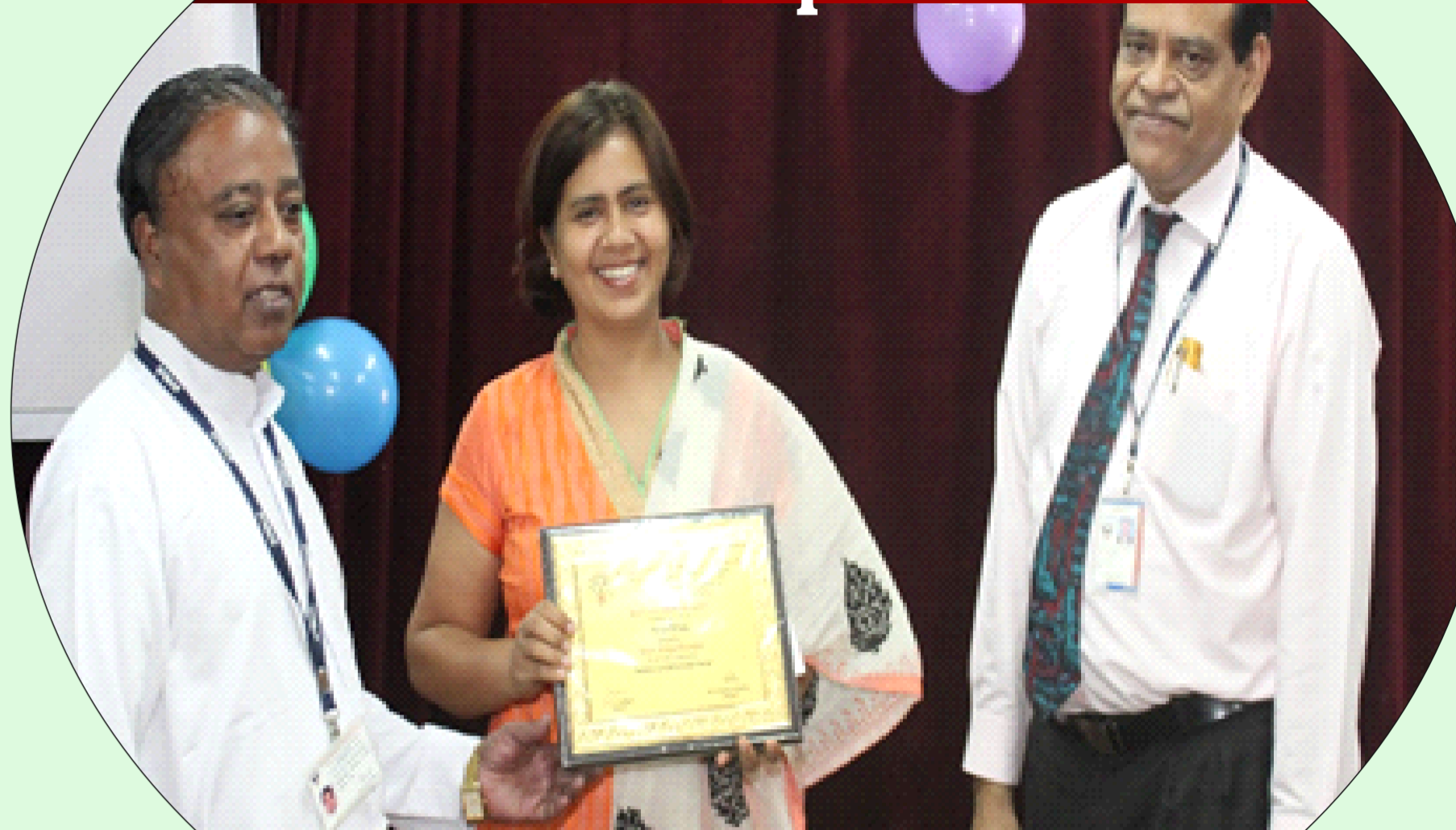
Best Research Paper Award 1st Prize- 2017, SFIMAR