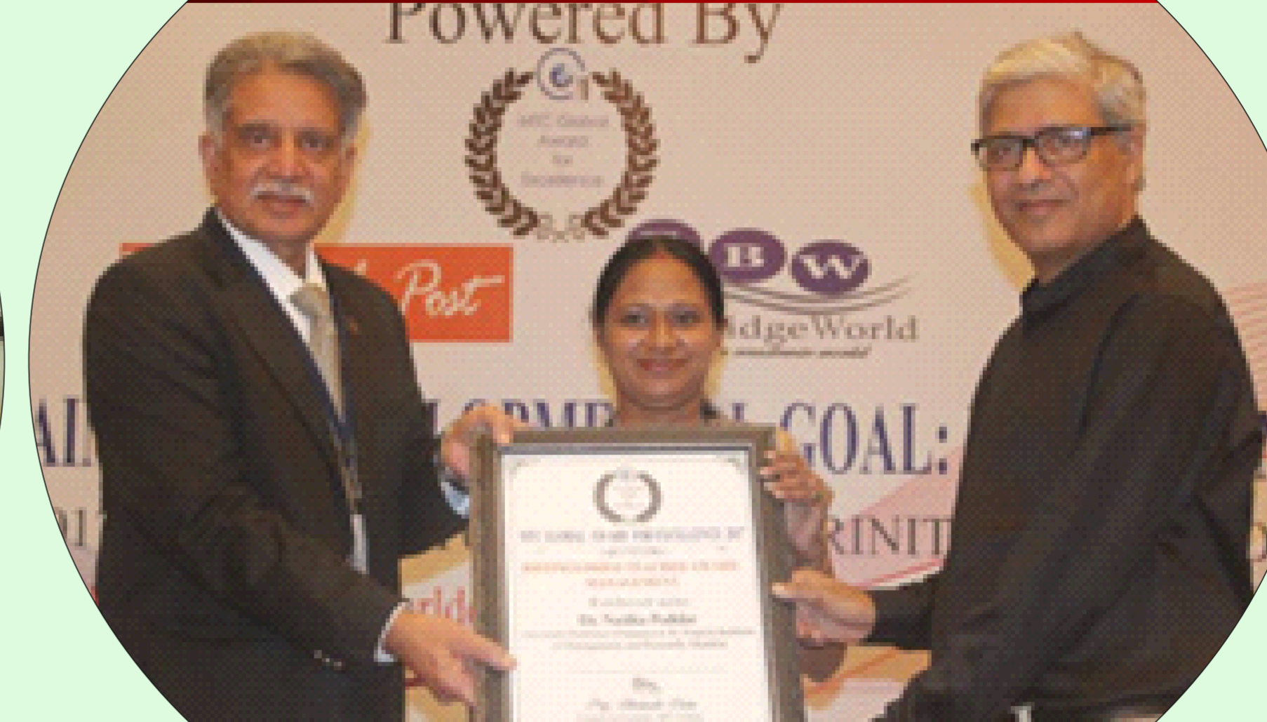
Distinguished Teacher Award 2017 – Management- MTC Global