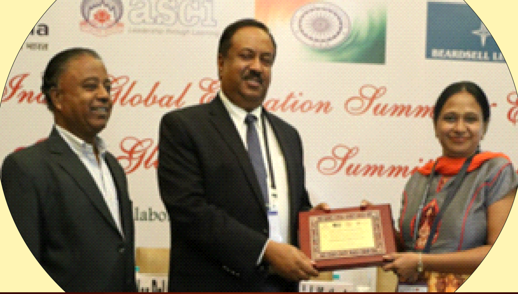
Honoured with Research Excellence Award 2017- Indo Global Education Summit