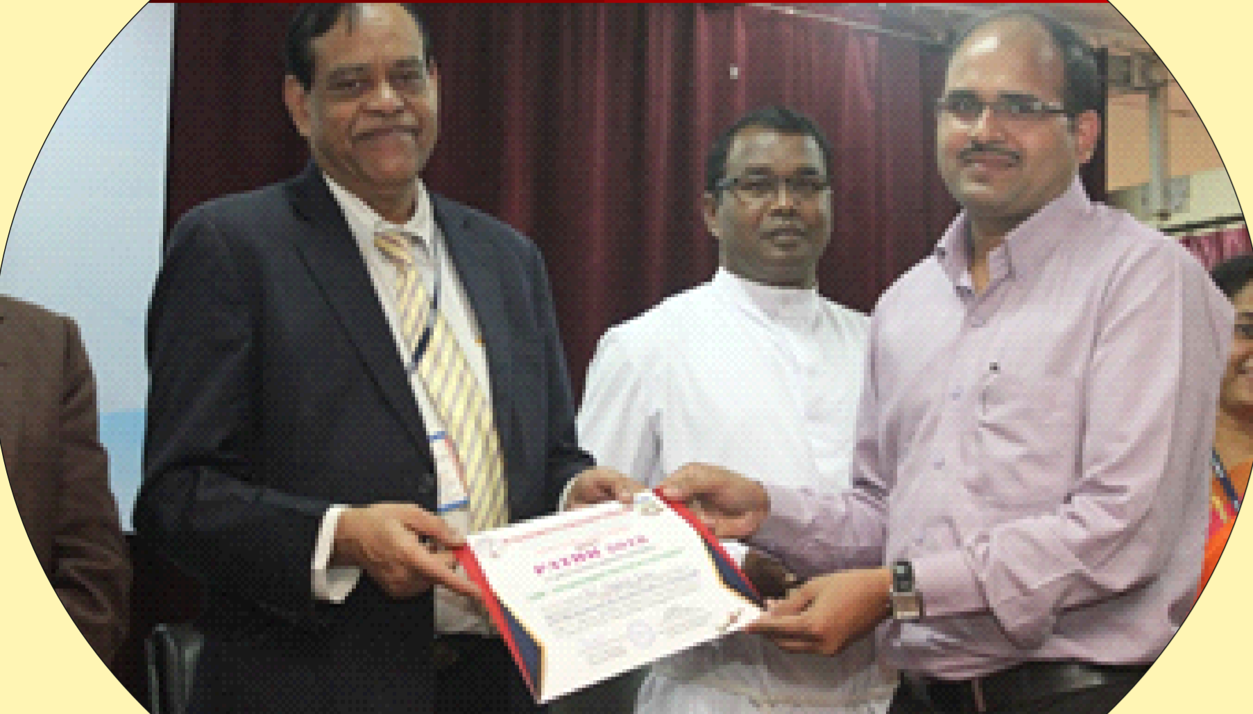
Best Research Paper Award at PATHH 2018