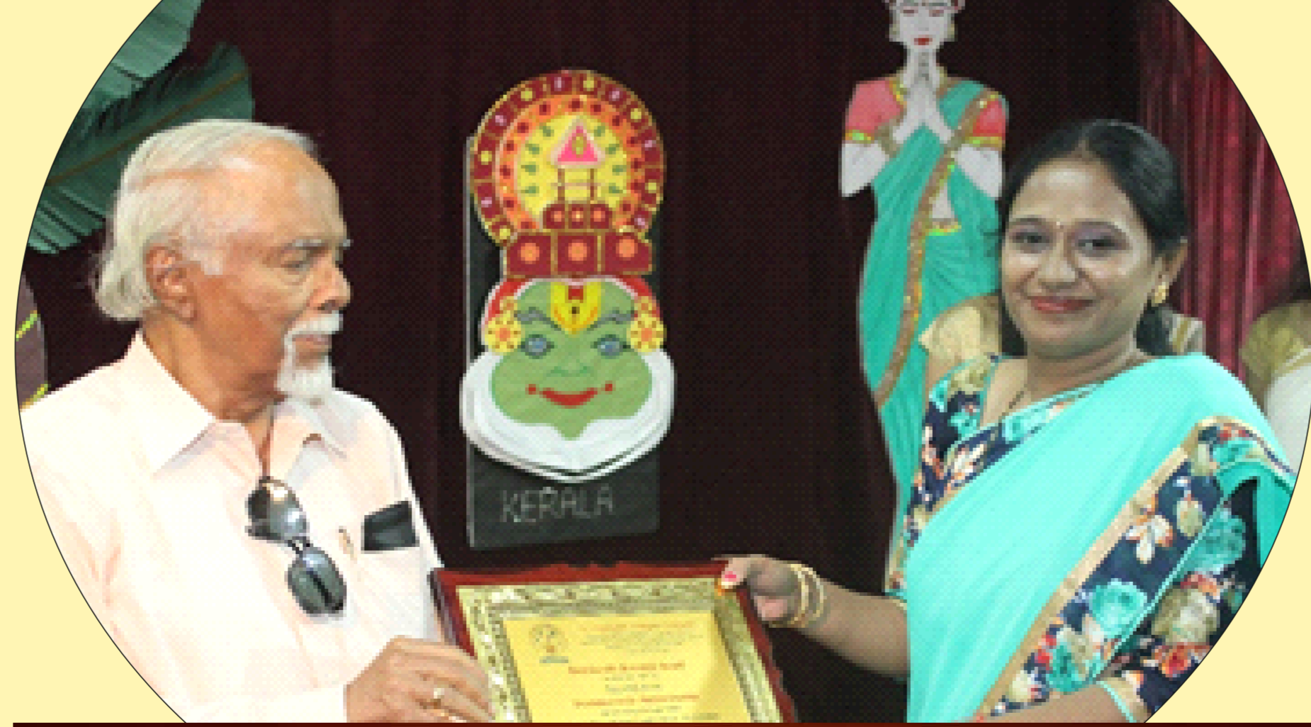
Best Research Paper Award 2nd Prize- 2016, SFIMAR