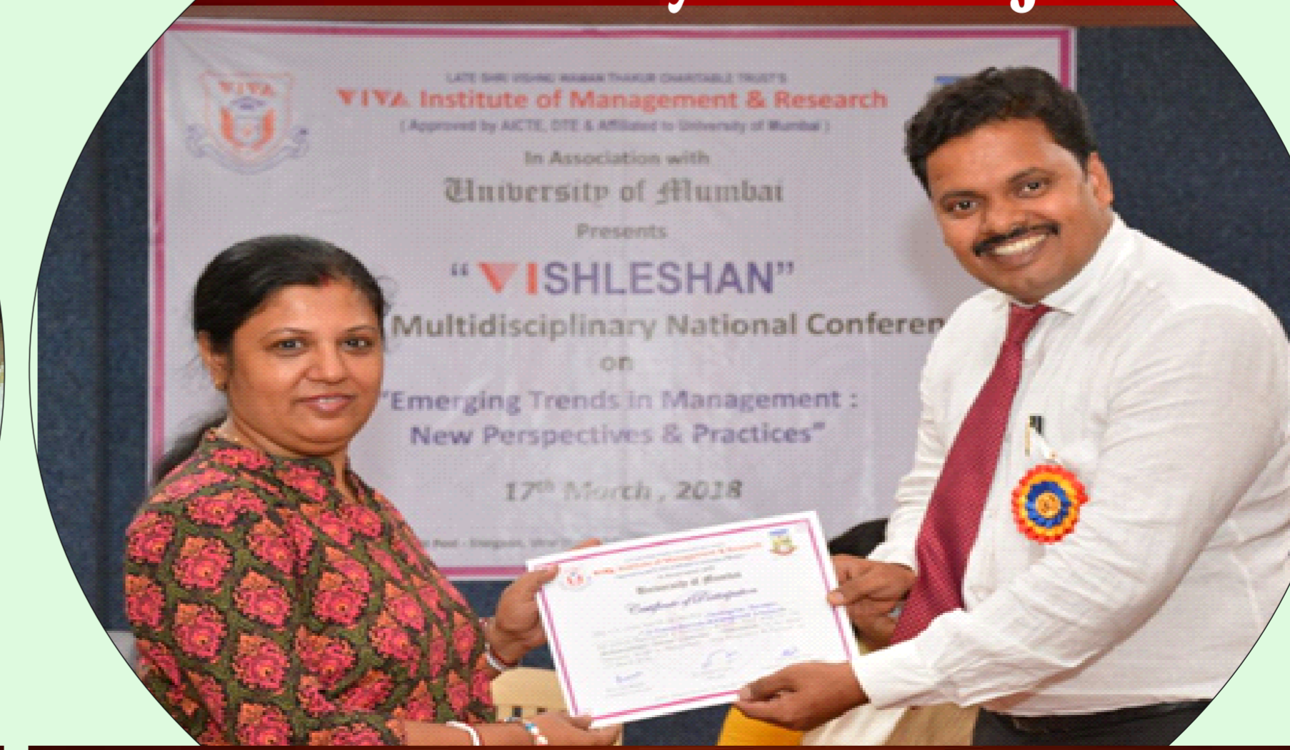
Best Research Paper Award Vishleshan 2018- VIVA Institute