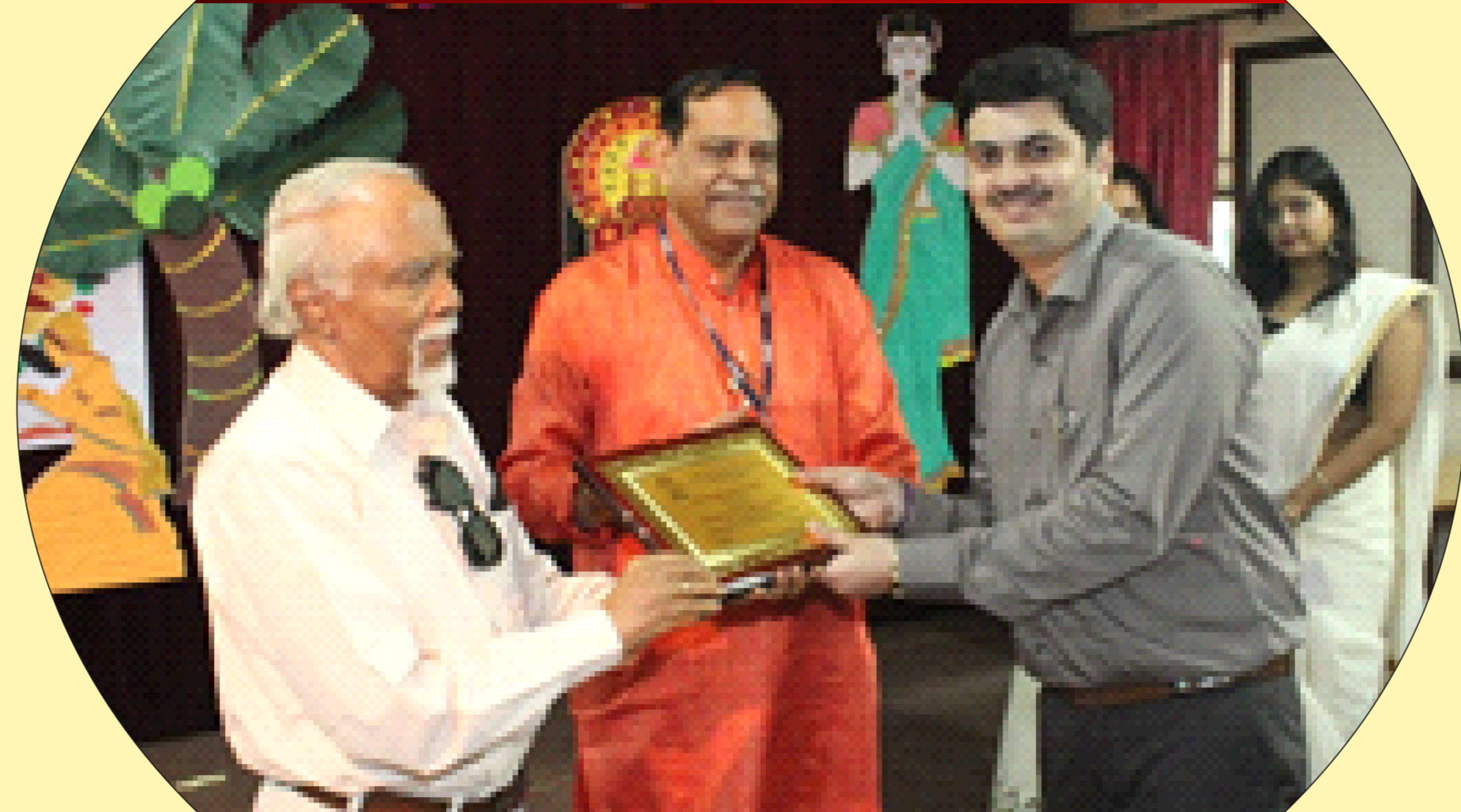
Best Faculty Research Award – SFIMAR, 1st prize 2016