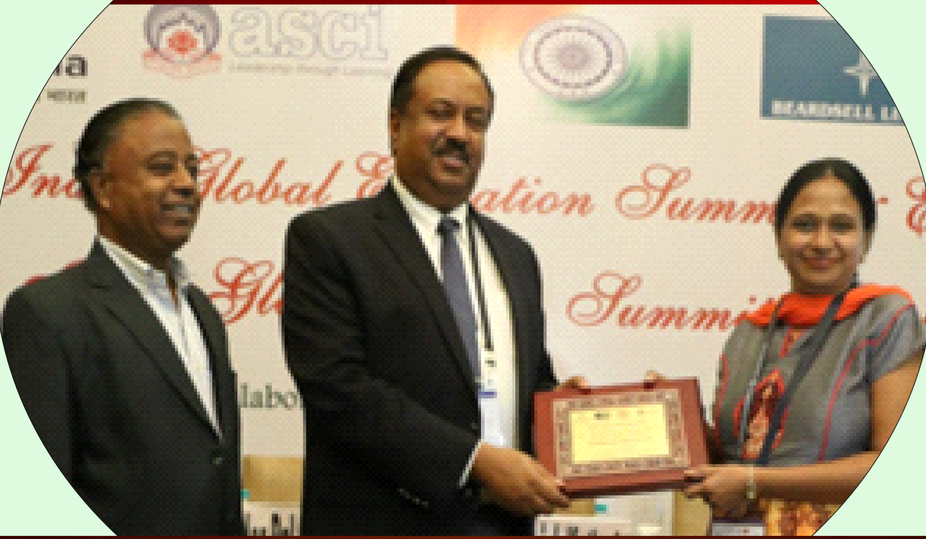
Honoured with Research Excellence Award 2017- Indo Global Education Summit