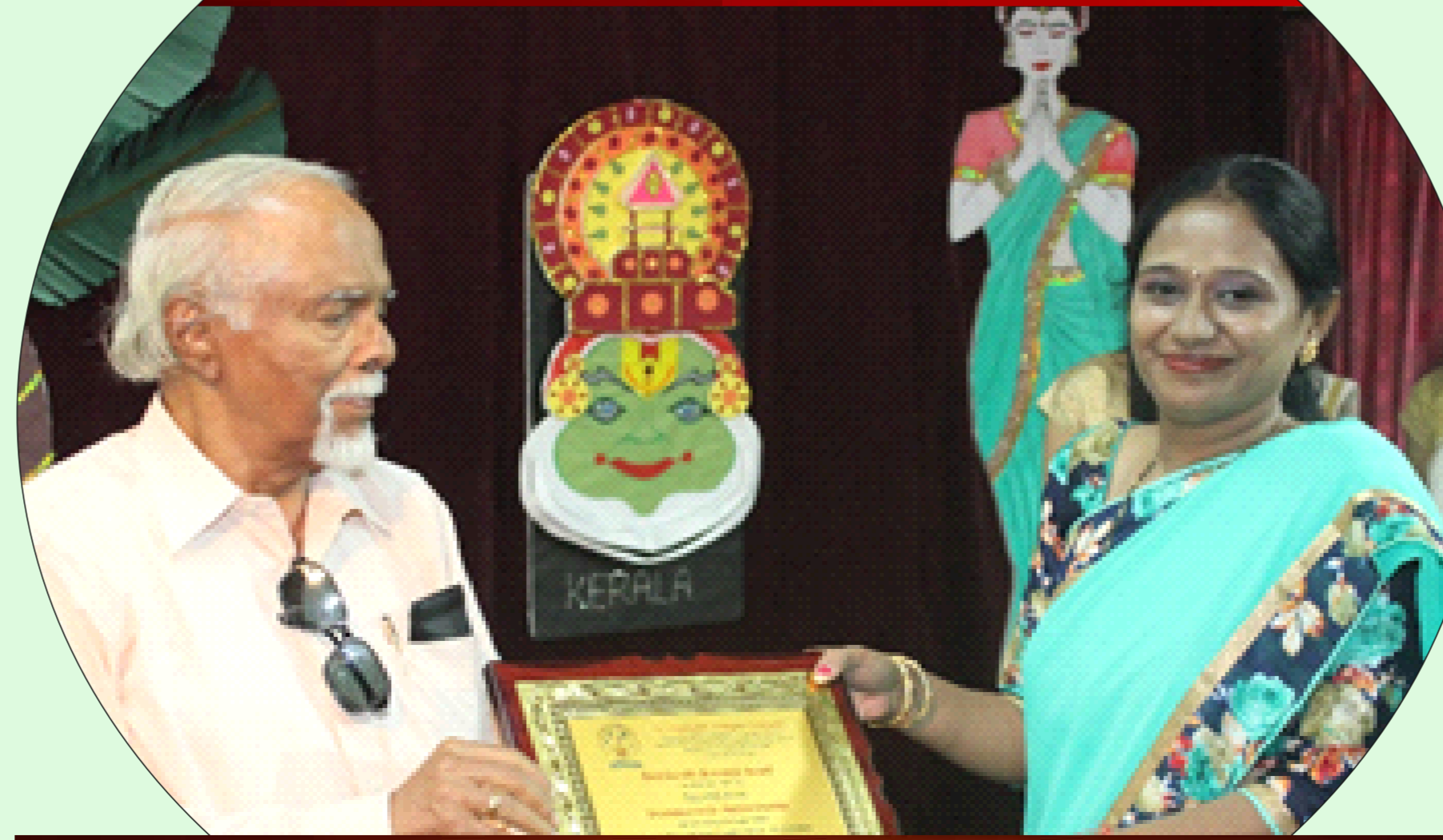
Best Research Paper Award 2nd Prize- 2016, SFIMAR