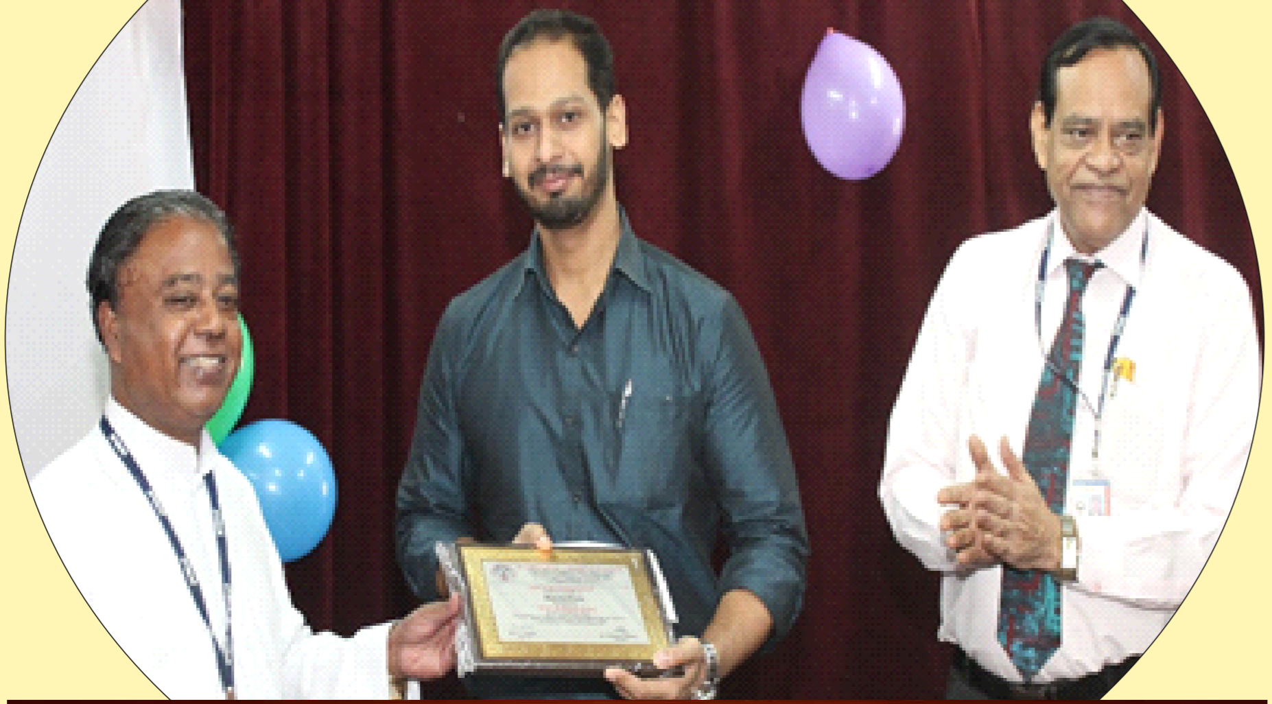
Best Research Paper Award 2nd Prize- 2017, SFIMAR