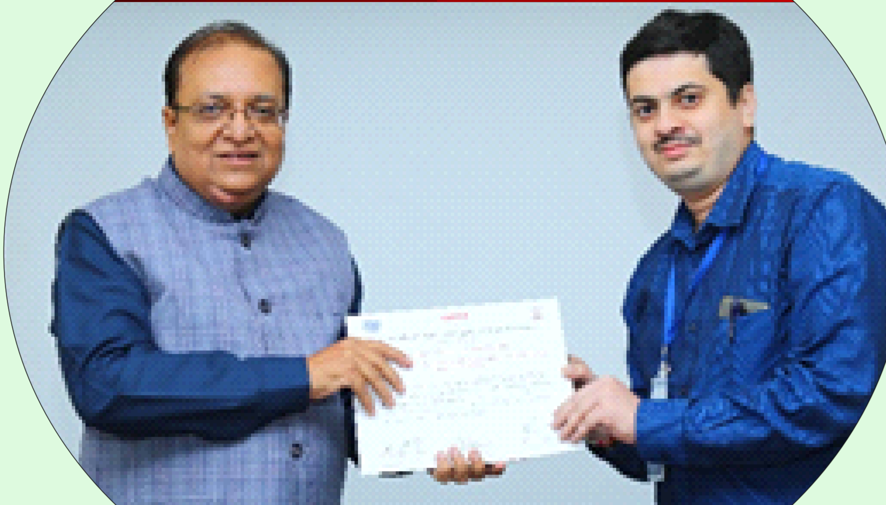
Best Paper Award-"Analysis of Risk and Returns of Public sector banks - (Study to Find out Risk and Returns Generated by Public Sector Banks From 2003 To 2018)" was presented at SIFICO 2019"